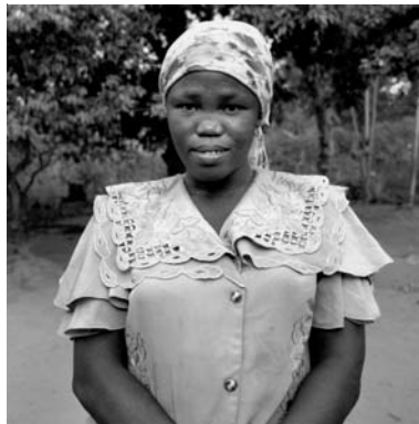
Blessed, Nigeria.