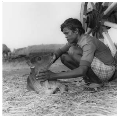
Noor, India.