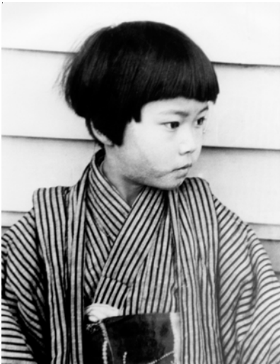
Unidentified young girl, Japan.