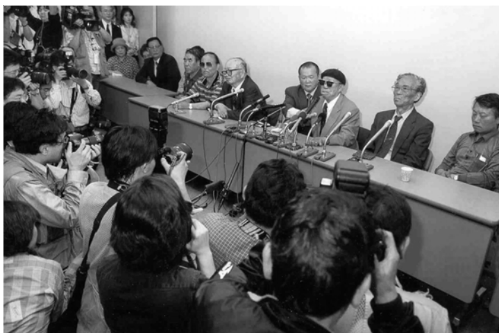
Press conference in Japan in association with the successful lawsuit filed against the government for severe human rights violations, including forced isolation, sterilization and late term abortions that resulted in the destruction of family ties and a generation without children.